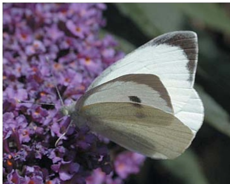
Large white (J.J. Clarke)