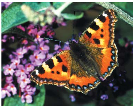
Small tortoiseshell

Lavandula angustifolia Buddleja davidii Centranthus ruber Origanum vulgare Nepeta x faassenii Verbena bonariensis Thymus vulgaris Scabiosa var. Hebe (summer-flowering variety)